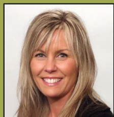
Student Activities Coordinator