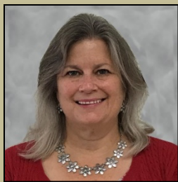
Membership Events / Exhibitors Title II