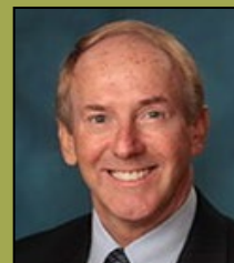
Director of Accreditation