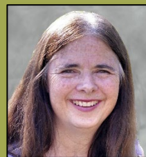
Accreditation Admin Asst.