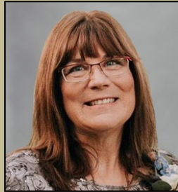
Membership Events Communications

Interacts with vendors that support your school and encourages their support of regional events.